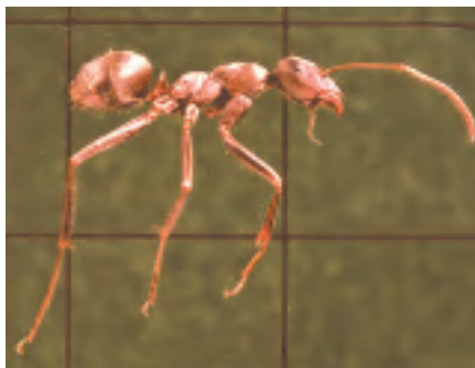
The Argentine ant loves its sweets.

If the concentration of active ingredient is too high, the ants will die too