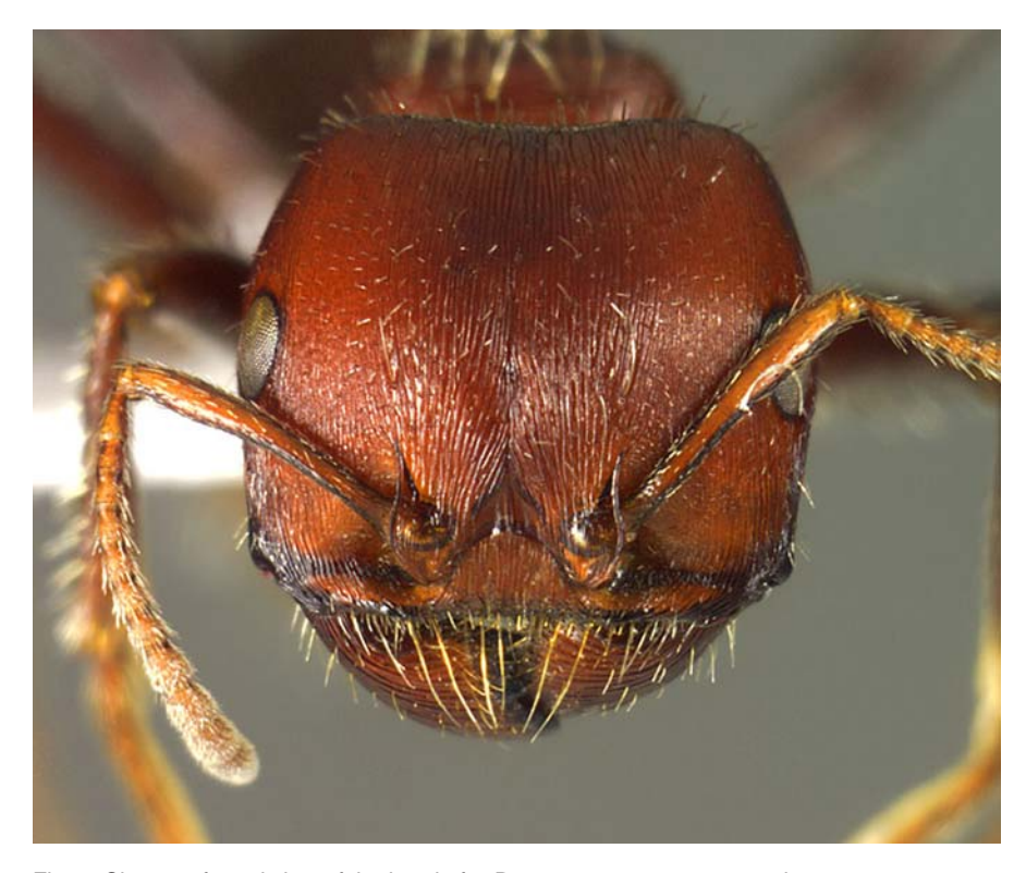
Fig. 1. Close-up frontal view of the head of a Pogonomyrmex rugosus worker.

Klotz, J.H. et al. - Harvester Ants in Urbanized Areas