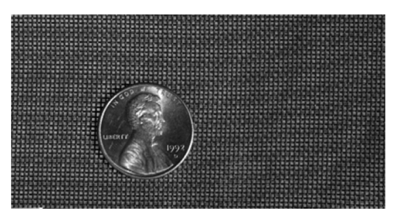
Fig. 2. Mesh with 0.59-mm openings (USSE 30) that prevented passage of L. hesperus spiderlings in four of five clutches. The coin has a diameter of 18.5 mm. The scale of the figure is actual size if the figure width is 72 mm.

In horizontal orientation, Latrodectus spiderlings readily passed through brass screen of 0.83-mm openings (USSE 20 mesh) or larger (Fig. 1). Those passing through did so on the first day after emerging from the egg sac. The next smallest mesh size (USSE 30, 0.59-mm openings) (Fig. 2) completely contained four of the five clutches; in the last clutch, a few individuals were able to squeeze through although